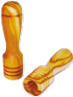
Olive wood potholders